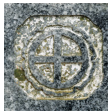
(Photo 3) The family emblem “Cross” that has been passed on for generations.