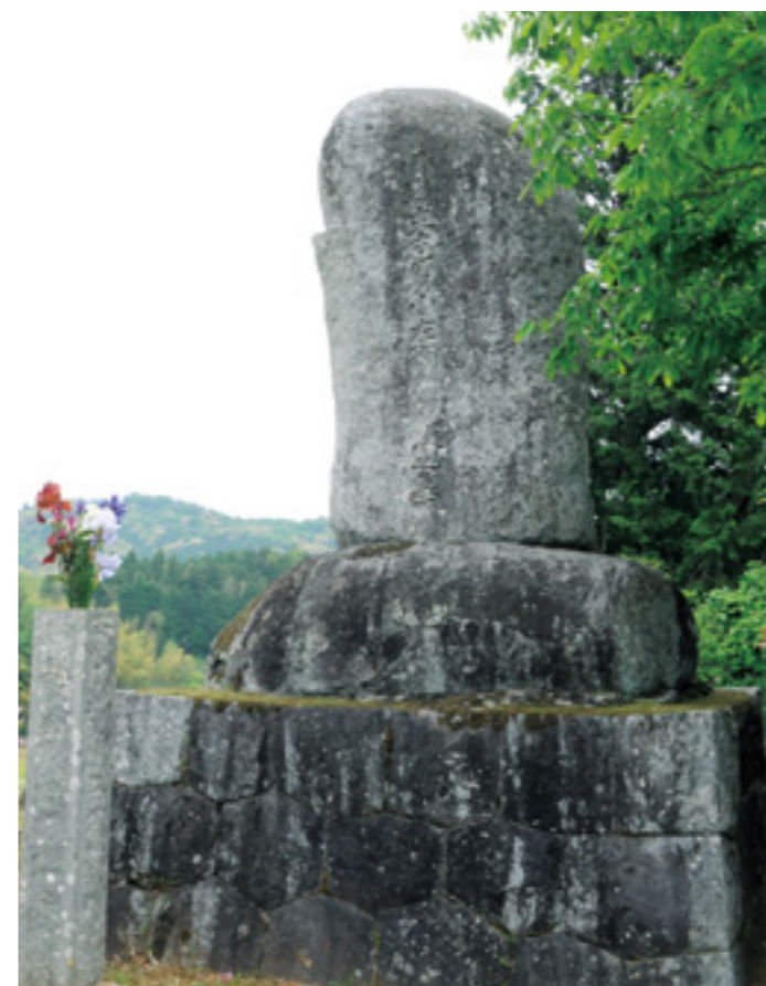
(Photo 1) Tombstone of Shiga Chikayoshi. “The master of Oka castle, Shiga Shozaemon Chikayoshi’s tomb” is inscribed on the tombstone.