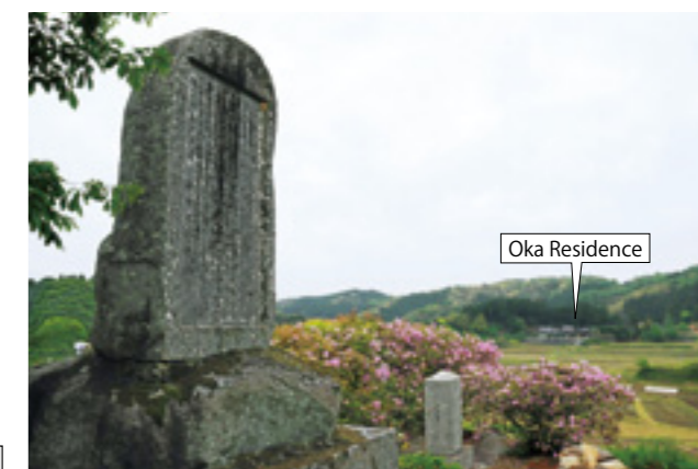
↑ A view of “Oka Residence” from the graveyard (Kamiunai)