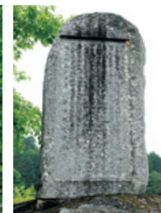
(Photo 2) The back of the tombstone Epitaph engraved on the back of the tombstone