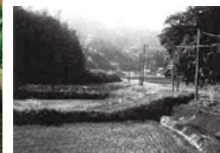
↑ Otashiro, where Shiga Chikayoshi was confined