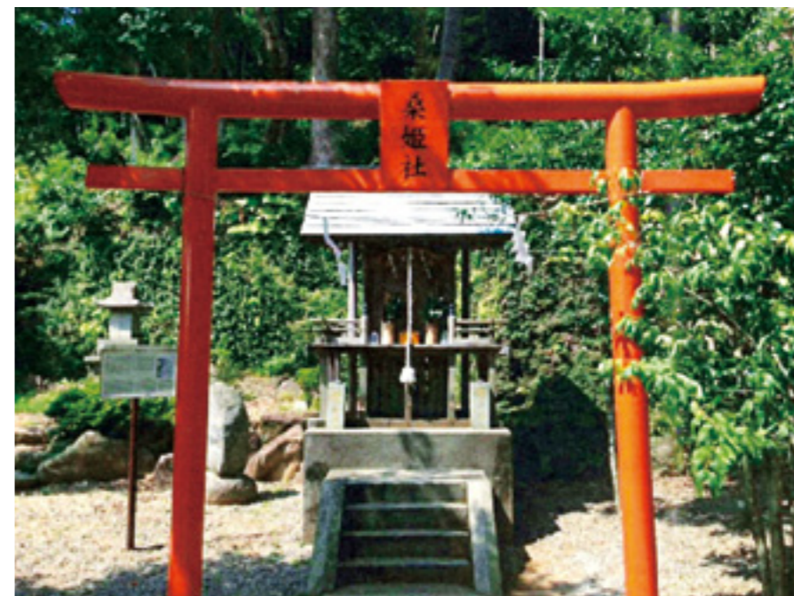
↑ The gate of the shrine where Kuwahime is enshrined