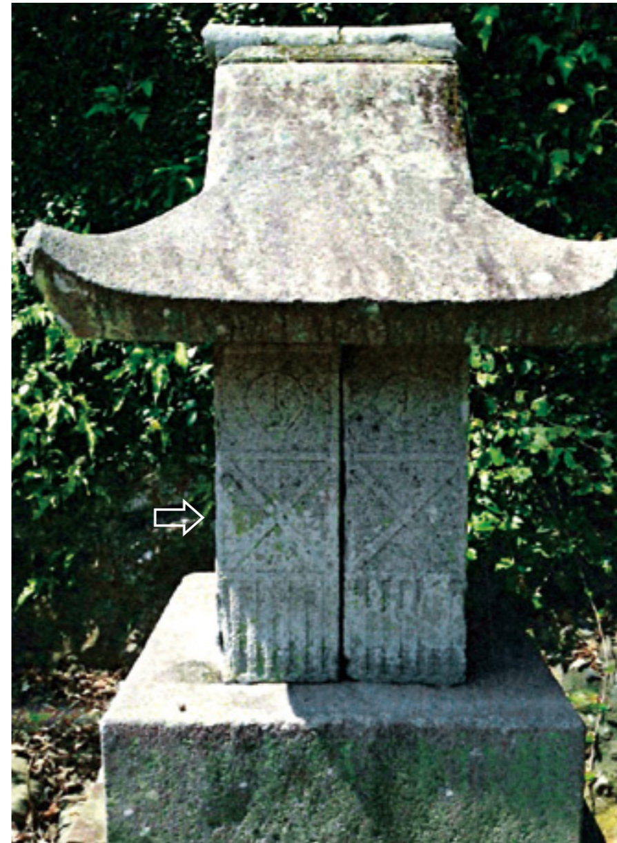
↑ Shrine for Kuwahime The mark of the St. Andrew's cross is found under the family emblem of the Otomo family

(Produced by the NANBAN Culture Promotion Division)