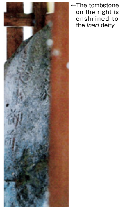
←The tombstone on the right is enshrined to the Inari deity