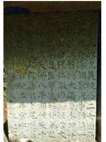
↑ A short description of Kuwahime's life is inscribed on the side including "...the second daughter of Otomo Yoshimune"