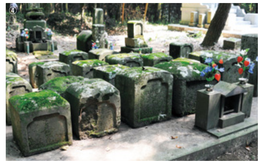
† Kakita family tomb