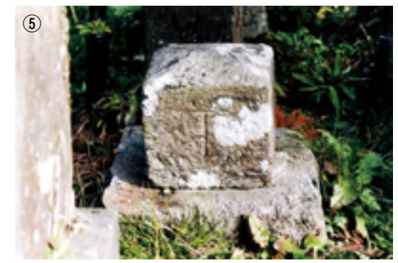
There are also Christian tombs in the Eraharu area